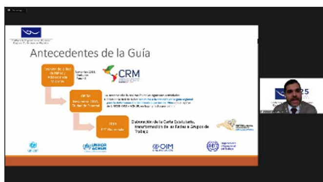
Presentation of the Guide, webinars RCM, (May 13, 2021)

Complementary instruments include the "Regional Guidelines for the Comprehensive Protection of Boys, Girls and Adolescents in the Context of Migration" (2016), the "Regional Guidelines for the Assistance to Unaccompanied Children in cases of Repatriation" (2009) and the "Regional Guidelines for Special Protection in Cases of Repatriation of Child Victims of Trafficking" (2007).